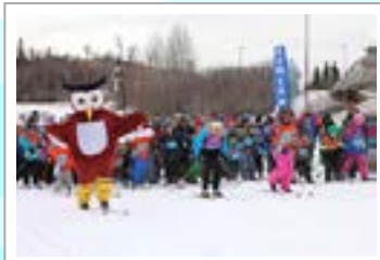
Ski 4 Kids was a big success with many activities beyond skiing and hundreds of kids from all over town attending. Thanks to all the sponsors, volunteers, organizers, kids and parents who participated!