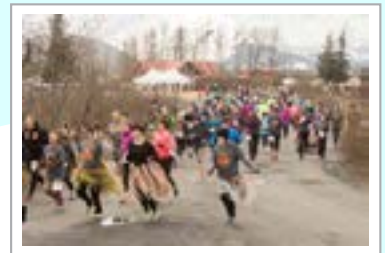
Healthy Futures was pleased to support the Bison Run Wild 5K at the Alaska Wildlife Conservation Center. Nearly 300 kids and adults participated!