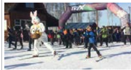
Healthy Futures was proud to support the free Schools on Skis event at Birch Hill in Fairbanks. More than 200 kids participated in the ski tour, obstacle course, downhill slalom and bonfire with s'mores. Well done, organizers and kids!