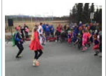
Healthy Futures had fun participating in th Superhero Showdown. Thanks to Skinny Raven Sports for including us and our Healthy Heroes for engaging with the kids!