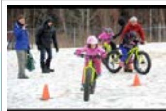
Despite some chilly and windy weather, the Winter Jamboree in Cuddy Park was a success and the organizers look forward to the event in 2017!