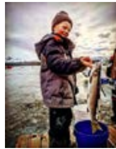
Healthy Futures was proud to support the MDA Ice Fishing Derby for a Cure in Wasilla. More than 300 people participated for a good cause — including 120 kids!