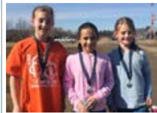
Great race supporting the Fairbanks Symphony with 1050 registered to Beat Beethoven!